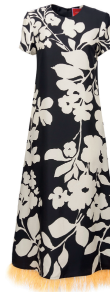
Milano Trench coat; Soul pendant necklace; Swing dress